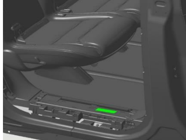
RH sill panel