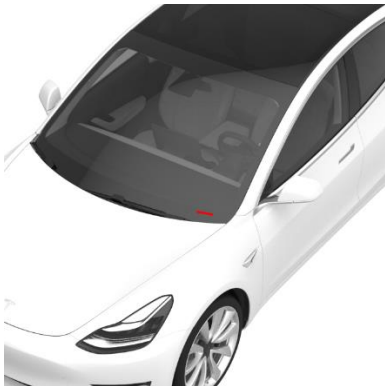
Driver's side windshield