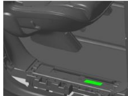
RH sill panel