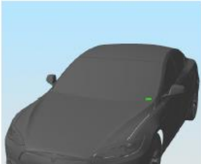
Driver's windshield bottom corner