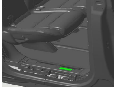
RH sill panel