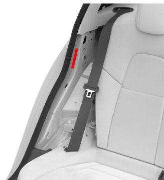
RH C pillar