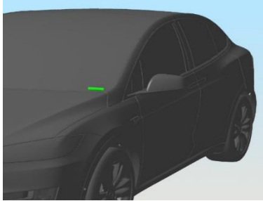
Driver's windshield bottom corner